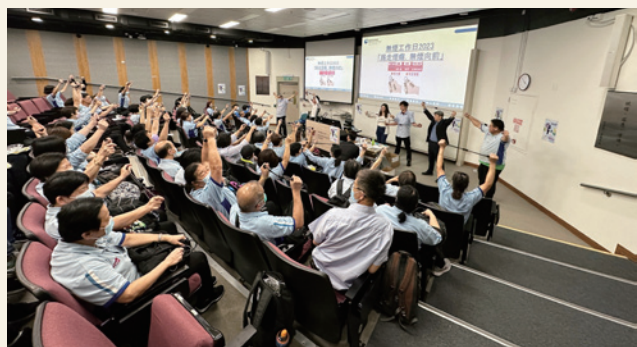
▲惠康環境服務與戒煙機構合辦無煙講座及工作坊，向員工宣揚無煙信息。 Waihong organized health talks and workshops to promote a smoke-free culture to staff.

A team was set up to conduct regular site inspections and enforce the smoke-free policy. They also visit frontline staff to understand their needs on smoking cessation, so as to formulate and provide the most suitable methods to help staff quit smoking.