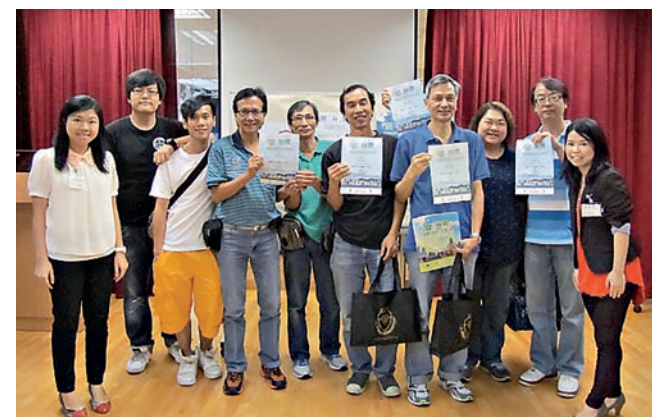
▲ 富安的員工可於辦公時間出席戒煙活動。 Richform's staff can attend smoking cessation workshops during office hours.

煙活動，讓員工於辦公時間參與戒煙工作坊，並提供戒煙輔導，亦向成功戒煙的員工頒發獎金獎；集團更會關懷及支援戒煙員工，如在辦公室內特設無煙閣，發放戒煙心得及煙害資訊，又定期透過電郵及內聯網鼓勵員工戒煙及投入無煙生活。