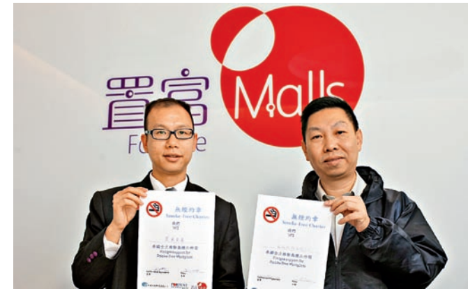
▲ 置富與承辦商簽署「無煙約章」。 ARA Asset Management signs smoke-free charter with contractors.