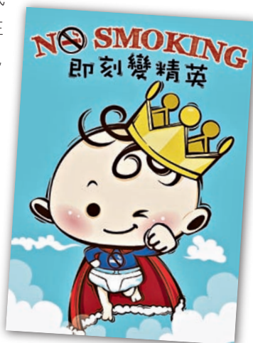
▲ 親子王國自家設計的無煙標誌。 The no-smoking sign specially designed by Baby-Kingdom.com.

公司旗下的親子王國環保教育基金先後到訪超過70家小學及幼稚園，為合共約20,000名學生舉辦講座，推廣環保及無煙信息。