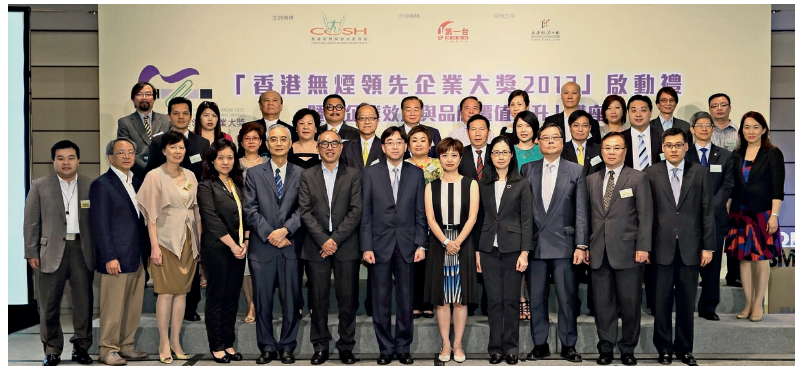
▲ 一眾主禮嘉賓感謝戒煙服務機構、三十多間來自不同行業的商會及聯會全力支持「香港無煙領先企業大獎2013」。 Officiating guests thanked the smoking cessation service providers and over 30 chambers of commerce and industrial associations for supporting the "Hong Kong Smoke-free Leading Company Awards 2013".

With the aims to encourage businesses to promote smoke-free messages and smoking cessation to their employees, customers and the general public for a smoke-free Hong Kong, Hong Kong Council on Smoking and Health (COSH) organized the "Hong Kong Smoke-free Leading Company Awards" in 2011 with overwhelming responses from companies of different industries. In 2013, with the full support of over 30 major commerce chambers and associations in Hong Kong, COSH organized the Awards again in collaboration with Radio 1 of RTHK.