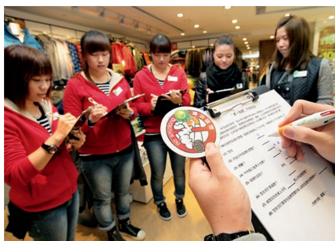
▲ Bossini首先發起「問卷調查齊齊做」活動，了解員工的吸煙習慣及原因，再制定合適的無煙政策。 Bossini conducted survey to understand the reasons and pattern of smoking and plan appropriate smoke-free policy for staff.

大型企業如何有效把無煙文化傳遞予員工？關鍵是對症下藥。Bossini作為擁有約1,000名香港員工的企業，就以「問卷調查齊齊做」作起點，其人力資源副董事鄧碧儀指出，調查能讓公司迅速掌握員工吸煙的原因及習慣等資訊，有助制定合適的無煙政策。調查成功收集逾600份問卷，並透過不同途徑與所有同事分享問卷