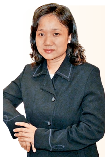
黃宏 醫生 衛生署控煙辦公室主管

Employees perform better and work more efficiently with good health and a positive frame of mind. For corporate's sustainable development, employers should promote smoke-free messages proactively. With full support of commerce chambers and associations in Hong Kong, the Awards in 2013 drew participation of many businesses and SMEs. The commerce chambers and associations not only focus on the industries' development, they also keep an eye on the well-being of their practitioners. By encouraging businesses to help their staff quit smoking and build a healthy lifestyle, they are safeguarding the most important asset of the industries. I hope different sectors can work hand-in-hand to spread the smoke-free culture and strive for a smoke-free Hong Kong.