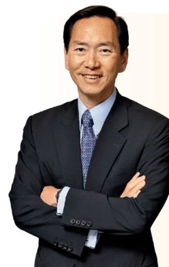
陳智思 GBS 太平紳士 亞洲金融集團總裁