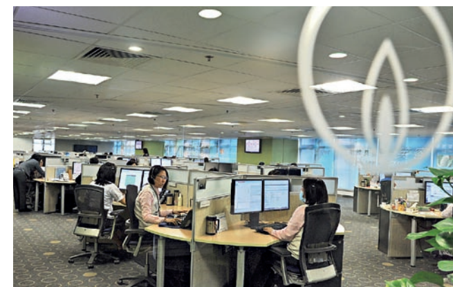
▲ 中華煤氣早於1999年已實施無煙工作間。 Towngas has implemented smoke-free workplace initiatives since 1999.