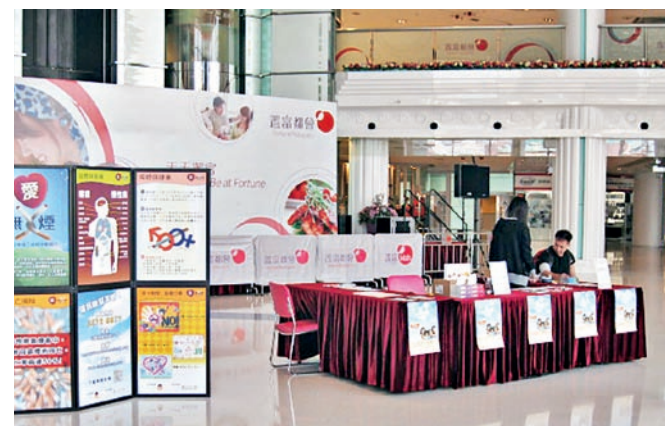
▲ 置富積極在旗下管理的17個屋苑商場推廣無煙文化。 ARA Asset Management proactively promotes smoke-free culture in its 17 shopping malls.

置富不僅在旗下商場舉辦無煙展覽，管理層更主動出席有關推廣無煙企業的宣傳活動，包括出席電台節目，透過大氣電波介紹無煙企業措施及分享成功經驗。另外，商場更免費提供場地予香港吸煙與健康委員會設置「戒煙大贏家」招募攤位，並讓戒煙服務機構於場內