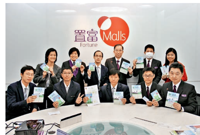
▲ 置富積極鼓勵員工參與戒煙。 ARA Asset Management proactively encourages staff to quit smoking.

其實，置富早於2011年已成立無煙文化促進委員會，由物業管理代表組成，定期舉行會議檢討無煙政策的執行及宣傳。公司亦定期調查員工的吸煙習慣，了解不同物業的情況，對症下藥，擬定有效的方案。公司更與外判商簽署無煙約章，請對方承諾其員工於工作時不吸煙，共同營造無煙健康環境。