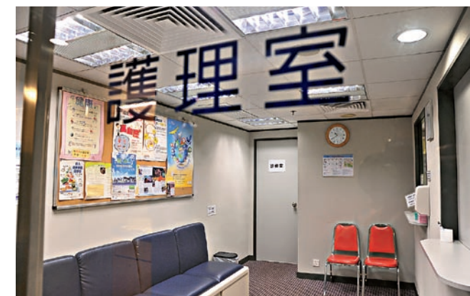
▲ 公司診所的醫生會主動了解吸煙同事的生活習慣，提供戒煙方法。 Doctors at in-house clinic will understand the smoking habit of employees and suggest ways to quit.