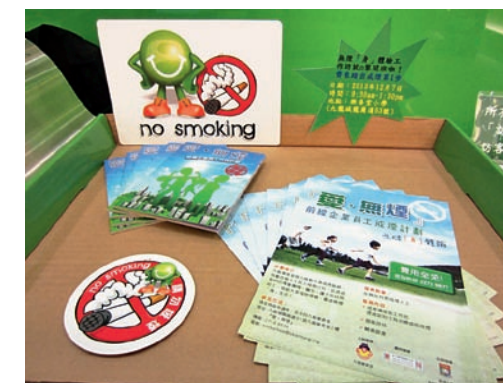
▲ Bossini設計具品牌特色的禁煙標誌。 Bossini incorporated the brand value into the design of no-smoking sign.