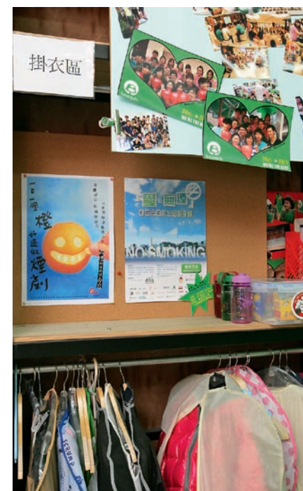
▲ 公司於店舖後倉及員工休息間張貼海報，提醒員工無煙生活的重要。 Bossini put up posters in staff resting areas to promote the importance of a healthy smoke-free lifestyles.

真摯笑臉由心而發，如能平衡生活與工作，亦有助減少依賴吸煙減壓。鄧碧儀形容，多數人吸煙都因為壓力，為了幫助員工透過健康活動減壓，Bossini Happy Staff Club推出「生活與工作平衡週」，「定期舉辦球類比賽及運動班等活動，能幫助員工減壓，減少依賴吸煙。」此外，公司亦為有意戒煙的員工安排戒煙工作坊，鼓勵同事與家人一同參加，為無煙城市出力。