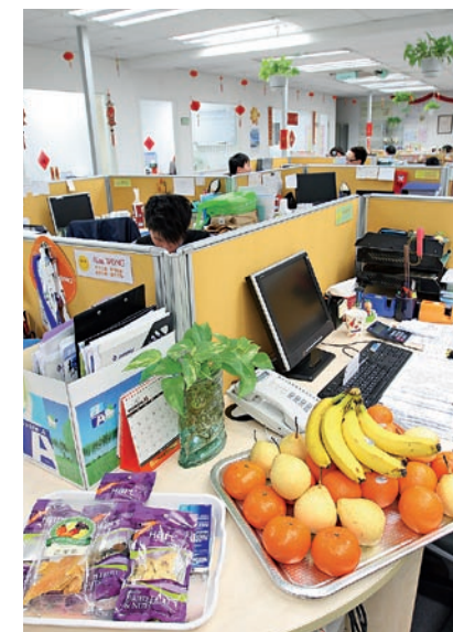
▲ 管理層每日為員工提供水果及健康小食，宣揚無煙健康生活模式。 Management provides fruits and healthy snacks to staff everyday, in order to promote a healthy smoke-free lifestyle.

對外方面，集團向客戶及社會大眾推廣無煙文化，如透過會員通訊及公司網頁傳播無煙信息、由旗下受惠浦之友主動發起支持世界無煙日等活動。義工隊伍亦積極協助宣傳無煙信息，帶領更多朋友加入無煙陣營，為清新環境出一分力。