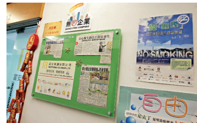
▲ 富安制定可持續的無煙政策，由上而下推動無煙文化。 Richform implements a sustainable smoke-free policy which is fully supported by the management and its staff.