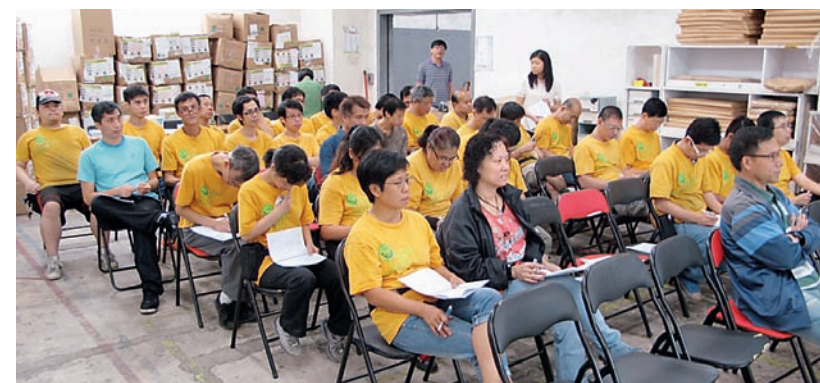
▲ Bossini為員工舉辦「無煙『身』體驗工作坊」。 Bossini organized workshops to promote smoke-free messages.

公司由健康生活入手推廣無煙文化，先從戒煙的好處及認識自己的煙癮程度著墨，為寫字樓同事、店舖主管及貨倉員工舉行共三場無煙講座，請來戒煙服務機構專業人士分享煙害資訊及戒煙貼士，並特別加強二手煙