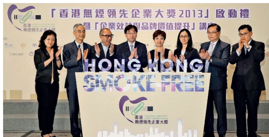
▲ 一眾主禮嘉賓啟動「香港無煙領先企業大獎2013」，呼籲全港企業支持無煙香港。 Officiating guests kicked off the "Hong Kong Smoke-free Leading Company Awards 2013" and encouraged companies to support a smoke-free Hong Kong.

2013年的大獎收到超過340間來自各行各業的企業報名角逐各獎項，參與企業數目比2011年上升超過六成，受惠員工更加超過六萬人，成績令人鼓勵。參與企業經過初步評估、詳細評估及獨立評審團於2013年12月4日舉行的最後評審，最終10間企業獲頒「金獎」；8間企業獲頒「銀獎」；5間企業獲頒「最具創意無煙企業政策獎」及超過300間企業獲頒「優異獎」以表揚對無煙文化的支持。