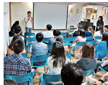
▲ 公司舉辦講座，向員工介紹減壓方法及健康生活的要素。 Baby-Kingdom.com introduces healthy lifestyle and stress management to staff via seminars.

根據調查結果，員工吸煙主要是因為壓力，故公司透過不同活動紓緩員工的壓力，幫助他們減低煙癮，包括提供以壓力及健康為主題的講座，介紹減壓方法及健康生活的要素。公司又主動於每星期舉辦生果日，提醒員工注重飲食均衡，並於辦公室內放置對抗口癮的小食如香口膠等。此外，公司亦向員工派發戒煙宣傳單張，並於辦公室內張貼無煙海報及自家設計的無煙標誌。現時，公司40多名員工中，僅3至4人為間中吸煙人士，他們的吸煙量亦已大大減少。