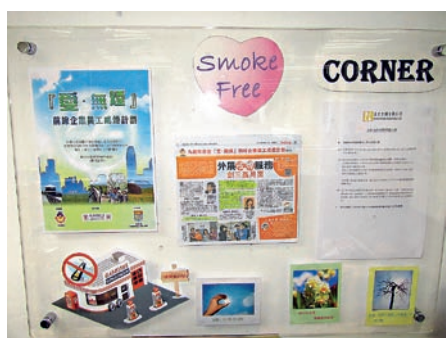
▲ 集團的無煙工作小組會不時更新煙害資訊。 Richform's smoke-free taskforce updates the smoke-free information regularly.