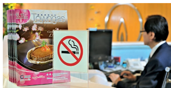
▲ 中華煤氣在陳列室放置了無煙標誌。 Towngas showroom put up no-smoking signage.

為響應「健康生活每一天」的年度主題，公司於2013年5月舉辦健康日，約200名同事踴躍參與。中華煤氣高級人力資源經理張子筠表示，活動邀請了九龍樂善堂「愛·無煙」計劃的註冊護士主講戒煙講座，即場派發戒煙小冊子及工作坊資料，並為同事進行基本身體檢