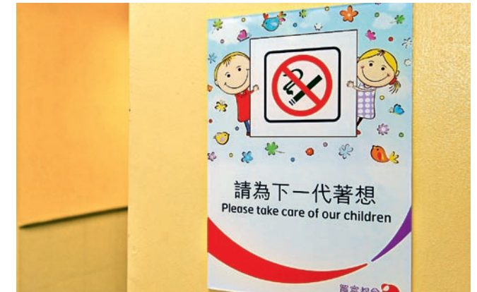
▲ 繽紛的禁煙標誌較傳統標誌更能吸引小孩與家長的注意。 The tailor-made colourful no-smoking sign can attract the attention of children and parents.