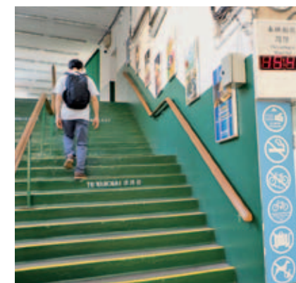
▲ 天星小輪自1997起已實行全面禁煙，以保障乘客及員工的健康。 Star Ferry implemented a total smoking ban since 1997 to safeguard passengers and staff's health.

在多元化的無煙措施配合下，公司成功推動不少員工投入健康生活，吸煙員工比例由2004年的六成逐步下降至2016年的四成，足證持續推行無煙政策的成效。天星小輪期望，公司能成為員工的支援後盾，推動他們儘快落實戒煙，進一步令吸煙率下降。