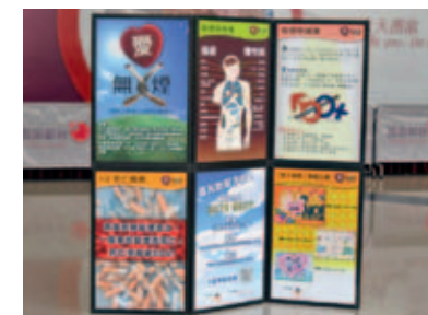
▲ 置富定期在商場內舉辦展覽，推廣無煙信息。 ARA organized exhibitions in retail malls on a regular basis to promote smoke-free messages.

置富亦樂於透過傳媒訪問分享其成功經驗，以鼓勵其他企業一同推動無煙文化，展望未來，他們將繼續向不同的持份者包括員工、商戶、承辦商、客戶以及市民大眾宣揚無煙信息。