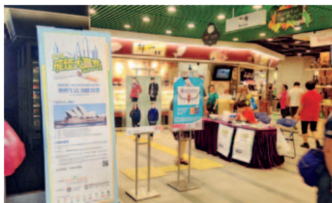
▲ 領展在旗下零售物業如商場、街市設置「戒煙大贏家」招募攤位，宣傳戒煙。 "Quit to Win" recruitment booths were set up at LINK's retail properties such as fresh markets and shopping malls to promote smoking cessation.

領展物業管理部總經理趙梓珊分享，「透過領展的完善網絡，活動能接觸各區不同階層的市民，大大增加了吸煙者戒煙的動力。」在2016年，「戒煙大贏家」活動於領展提供的場地內成功招募近600名吸煙人士參與，踏出戒煙第一步，佔活動近一半的參加人數，成績令人鼓舞。而成功戒煙的參加者除了贏得健康，亦可獲得豐富的獎品，成為真正大贏家。