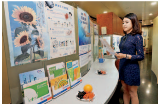
▲ 公司擺放無煙小冊子宣傳戒煙。 Smoke-free pamphlets are available in office to promote smoking cessation.

處，每年的世界無煙日均以互聯網發放有關資訊，鼓勵員工進一步將無煙信息傳遞予家人和朋友。公司亦定期與東華三院、博愛醫院及九龍樂善堂合作，舉辦戒煙健康講座及提供一氧化碳呼氣測試，同時為吸煙員工提供戒煙服務轉介。