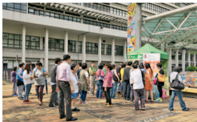
▲ 葵涌醫院在院內的公眾花園舉行無煙街站活動，加強大眾對煙草禍害的關注。 A smoke-free booth was set up in the garden of Kwai Chung Hospital to raise public awareness on smoking hazards.

醫院於2002年成立反吸煙工作小組，由醫生、護士、職業治療師、臨床心理學家、行政人員等組成，定期進行會議，專責制定及檢討院內的無煙政策。此外，