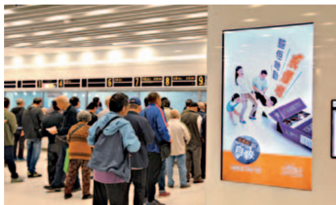
▲ 投注處內的電子屏幕展示不同的無煙海報，以推廣無煙信息。 Digital posters were displayed at Off-course Betting Branches to promote smoke-free messages.

馬會於遍布港九新界各區的投注處定期張貼或以電子屏幕展示不同的無煙海報，亦透過「Channel JC」電視頻道播放無煙宣傳短片，以全面營造支持戒煙的氛圍。另外，馬會於2015年及2016年在10間投注處擺放「友心健康資訊站」展板，以「毒從煙來 害己害人」及「戒煙好處多 齊做大贏家」為主題，提升市民對煙草禍害的認識，同時鼓勵戒煙。