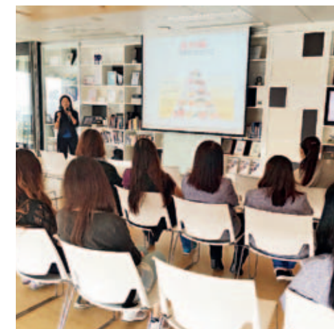
▲ 領展為員工舉辦健康講座，倡導工作與生活平衡。 LINK organized health talks for employees to advocate work-life balance.