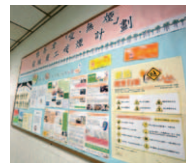
▲ 青洲英坭於公眾通道的壁報板張貼戒煙資訊及貼士，鼓勵員工戒煙。 Green Island Cement provided smoking cessation information and quit tips at exhibition board along the public corridor.

曾百中表示，「公司的戒煙推廣已見成績，希望透過於不同媒體積極與社會大眾分享成功經驗，將無煙文化推廣予其他企業，最終能令香港的整體吸煙人口進一步下降，共建無煙清新環境。」