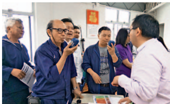
▲ 天星小輪為員工提供戒煙服務轉介，推動他們儘快戒除煙癮。 Star Ferry provided smoking cessation services referral to motivate the smoking colleagues to kick the habit as soon as possible.

為了有效幫助員工戒煙，天星小輪進行周年問卷調查，以了解員工吸煙情況，並邀請戒煙服務機構提供適切的服務，包括九龍樂善堂「愛·無煙」前線企業員工戒煙計劃，協助公司訂立各項無煙政策及措施，以及於辦公時間舉辦戒煙工作坊及講座，成功吸引不少員工參加。