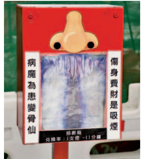
▲ 公司在工地吸煙區放置具警惕性的煙蒂收集箱，提醒工友吸煙的害處。 Threatening cigarette butt collection box was placed at the smoking areas of sites to remind smokers the hazards of smoking.