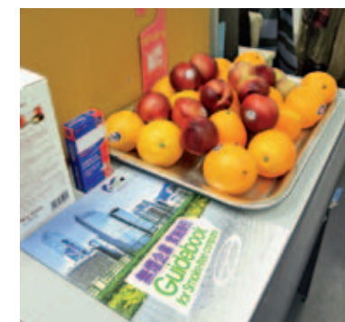
▲ 富安每日提供生果和健康小食，幫助員工對抗煙癮。 Richform provides fruits and healthy snacks everyday to help staff get rid of tobacco addiction.