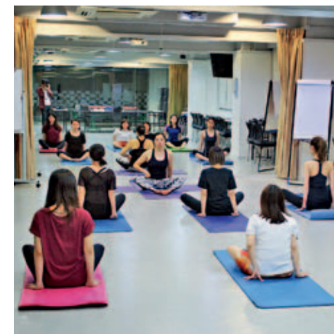
▲ 百麗舉辦靜觀瑜珈班，鼓勵員工保持身心健康。 Belle organized mindfulness yoga classes to encourage her employees developing a healthy lifestyle.