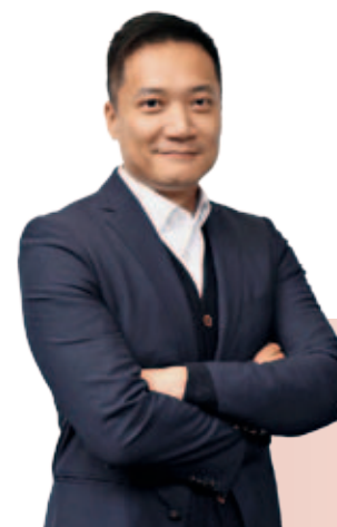
黃仰山教授 中文大學賽馬會公共衛生及基層醫療學院家庭醫學及基層醫療學部主管

Workplace is one of the places where employees spend the most of their time every day. Businesses can play a role in protecting the public health by providing a healthy working environment. Many smokers attributed the reason of smoking to social need which is difficult to rid. It is important for the businesses to create a supportive atmosphere for smoking cessation and strengthen the smokers' determination to quit. I am delighted to see companies maximized their reach in the society to disseminate smoke-free messages to every corner of the community. Health talks and workshops were organized to enhance employees' knowledge on smoking hazards while reward schemes were also introduced to encourage smokers to kick the habit. Businesses' dedication in implementing the measures and support from employees are definitely keys to advocate the smoke-free culture.