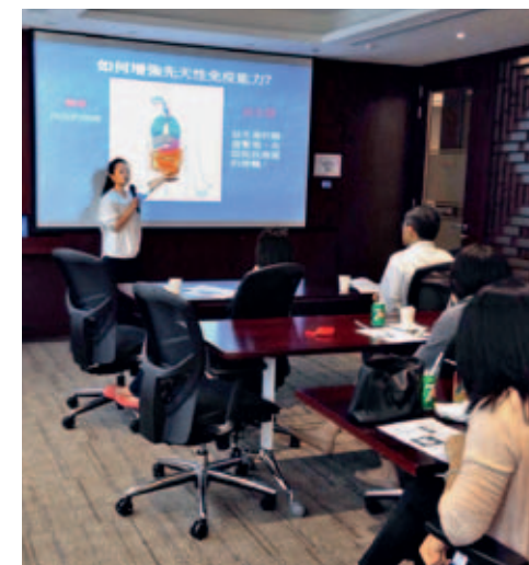
▲ 公司定期舉辦健康講座推廣無煙文化。 Health talks were organized regularly to promote a smoke-free culture.