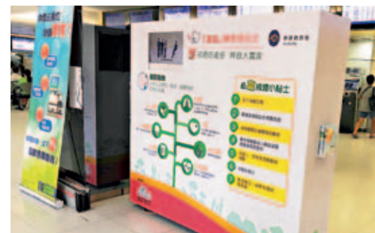
▲ 馬會的「友心健康資訊站」展板展示無煙資訊及派發小冊子，向市民推廣健康生活。 HKJC set up exhibition boards and distribute pamphlets to promote a healthy lifestyle among the general public.

未來，馬會將持續推動無煙文化，利用投注處內的空間，舉辦更多不同的推廣活動，包括健康講座及一氧化碳呼氣測試等，進一步向市民宣揚無煙生活的好處。馬會亦計劃與委員會合作在投注處內設立「戒煙大贏家」招募攤位，鼓勵市民參與戒煙比賽，成為無煙大家庭的一分子。