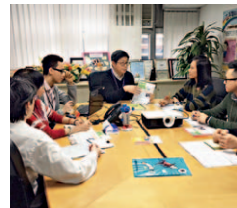
▲ 由行政總裁親自帶領的無煙工作小組會定期開會，以檢討無煙措施的成效。 The smoke-free taskforce led by CSO held regular meetings to evaluate the effectiveness of smoke-free policies.