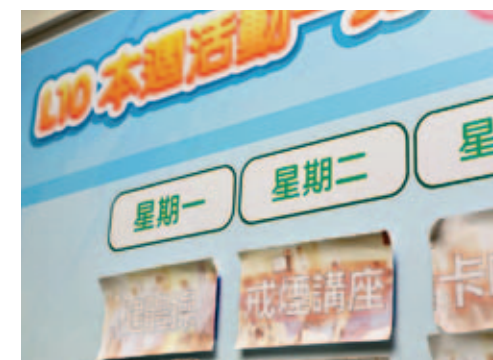
▲ 院方會定期為院友舉辦戒煙講座，幫助他們戒除煙癮。 Smoking cessation talks are held regularly to help patients quit smoking.

盧醫生形容，院方多年的禁煙工作，已累積一定的成功經驗，並有持續進步的空間，很高興醫院的努力獲得認同，並獲頒「三年卓越金獎」。未來院方將會繼續循教育入手，並在宣傳推廣方面注入創意，醫院團隊亦會總動員配合，凝聚醫護及院友，一同建立愉快清新治療環境及工作間。