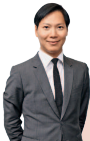
李培文 醫生 衛生署控煙辦公室主管

Being a socially responsible employer, business should protect its employees and the general public from the hazards of secondhand and third-hand smoke. Through law enforcement, publicity, education and provision of integrated smoking cessation hotline, the Tobacco Control Office of the Department of Health assists companies and organizations in providing smoking cessation support for their employees and stakeholders, in order to lower the smoking prevalence in Hong Kong. The participating companies of the Hong Kong Smoke-free Leading Company Awards have demonstrated their creativity in organizing various smoke-free activities, including cleaning cigarette butts on streets, displaying smoke-free collaterals and setting up promotion booths at smoking hot spots, which reminded the public to comply with the tobacco control legislation, raised public awareness on various smoking cessation services and promoted a smoke-free lifestyle among the general public.