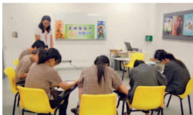
▲ 為羅湖懲教所在囚女性提供戒煙輔導。 Lo Wu Correctional Institution offers smoking cessation courses for female adults in custody.

署方先從宣傳同教育著手，為在囚人士安排反吸煙輔導及戒煙課程，又在各院所當眼處張貼推廣無煙的健