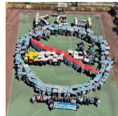
▲ 葵涌醫院於2015年慶祝該院全面禁煙10周年。 Kwai Chung Hospital celebrated its 10 th anniversary of smoking ban in 2015.