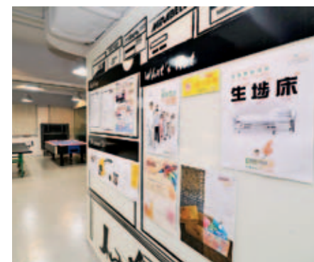
▲ 公司以不同的通訊渠道，向員工發放無煙健康資訊。 The company spread the smoke-free information to employees through various communication channels.

展望將來，百麗國際將加強與戒煙服務機構的合作，包括東華三院，向前線吸煙員工提供肺功能測試及戒煙門診的優先協助。香港的無煙計劃成效顯著，集團的深圳總部亦有意借鏡，計劃將無煙文化推廣至內地龐大的分店網絡。