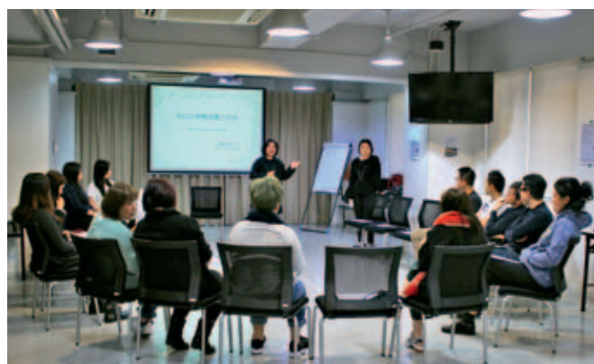
▲ 百麗與九龍樂善堂合作舉辦無煙健康講座，以推廣無煙文化。 Belle organized health talks in collaboration with Lok Sin Tong Benevolent Society, Kowloon to promote smoke-free culture.

她表示，減壓是員工吸煙的主要原因之一，因此，除定期與不同的戒煙服務機構合作舉行健康講座及無煙展覽外，亦推廣多運動少吸煙，鼓勵員工參與有益身