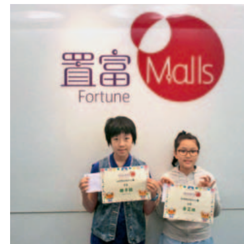
▲ 透過無煙標語比賽，市民可出一分力，一同建設無煙社區。 "Smoke-free Slogan Competition" was held to engage the general public in building a smoke-free community.