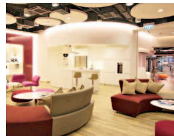
▲ 領展的「員工加油站」活動中心舉辦多元化活動，助員工減壓，建立無煙健康生活。 LINK organized various activities at the Staff Work-life Balance Centre for staff to release stress and develop a smoke-free healthy lifestyle.

持續的無煙工作間政策，不但能改善員工的健康，更贏得商戶的讚賞與支持，領展將繼續與商戶、顧客及各方持份者共同締造無煙環境，建立可持續發展的美好社區。