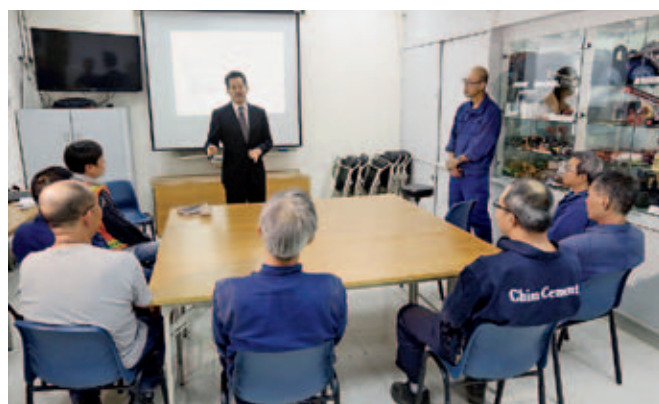
▲ 戒煙互助小組定期舉行聚會，鼓勵同事分享戒煙心得。 Smoking cessation support group meets regularly to share quit tips among staff.

戒煙的過程中可能會面對誘惑或退癮症狀等不適，互助小組利用即時通訊軟件開設群組，以便分享戒煙貼士及健康資訊，亦鼓勵同儕之間互相支持，幫助戒煙者克服困難及加強決心。此外，公司與不同團體合作，於