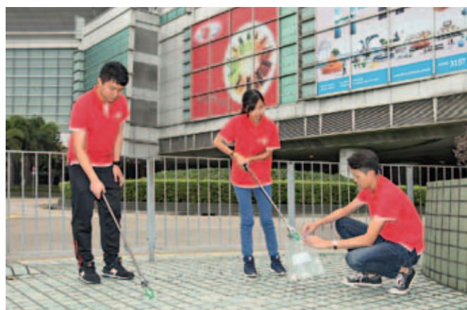
▲ 置富員工組成義工隊，於街頭收集煙蒂，向大眾推廣煙草禍害。 ARA's volunteer team collected cigarette butts on streets and promoted the hazards of smoking among the mass public.

置富自2011年成立無煙文化促進委員會，定期檢討現有政策及提出新措施，並進行調查以了解員工的吸煙習慣，對症下藥。公司於2013年開始參與九龍樂善堂的「愛·無煙」前線企業員工計劃，鼓勵員工戒煙，亦定期舉辦各類有益身心的活動，藉此宣揚工作與生活平衡，推動員工開展健康生活。此外，公司更特意推出戒