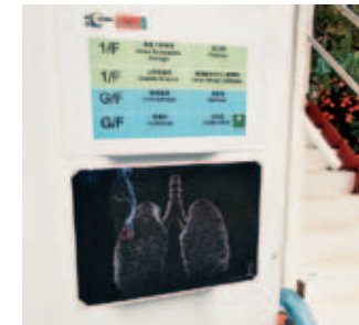
▲ 利基在工地通道張貼煙害圖象海報，鼓勵工友戒煙。 Posters with pictures of smoking hazards were posted at sites to encourage smoking cessation among staff.

這些體貼入微的創意措施除有效推動無煙文化，同時亦令利基獲評審團特別頒發「最具創意無煙企業政策獎」以作嘉許。「我們的理念從心出發，希望每個同事身體健康，讓他們感受到公司的關懷，從而增加歸屬感。」公司計劃於2017年逐步將無煙措施及「戒煙獎勵計劃」推展至其他工地，期望將無煙文化於建造業界發揚光大。