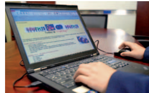
▲ 中信証券國際透過內聯網於世界無煙日向員工宣傳無煙信息。 CSI spreads smoke-free messages via intranet on World No Tobacco Day.

Michael認為，企業經常面對人事變動，要確保所有員工了解公司的無煙政策，成功因素在於持續推廣及加強溝通。公司亦致力向社會大眾宣揚無煙生活，管理層更積極支持各類無煙宣傳活動，例如新聞發佈會及報章訪問等，與其他企業分享推行無煙文化的經驗，為業界樹立榜樣。